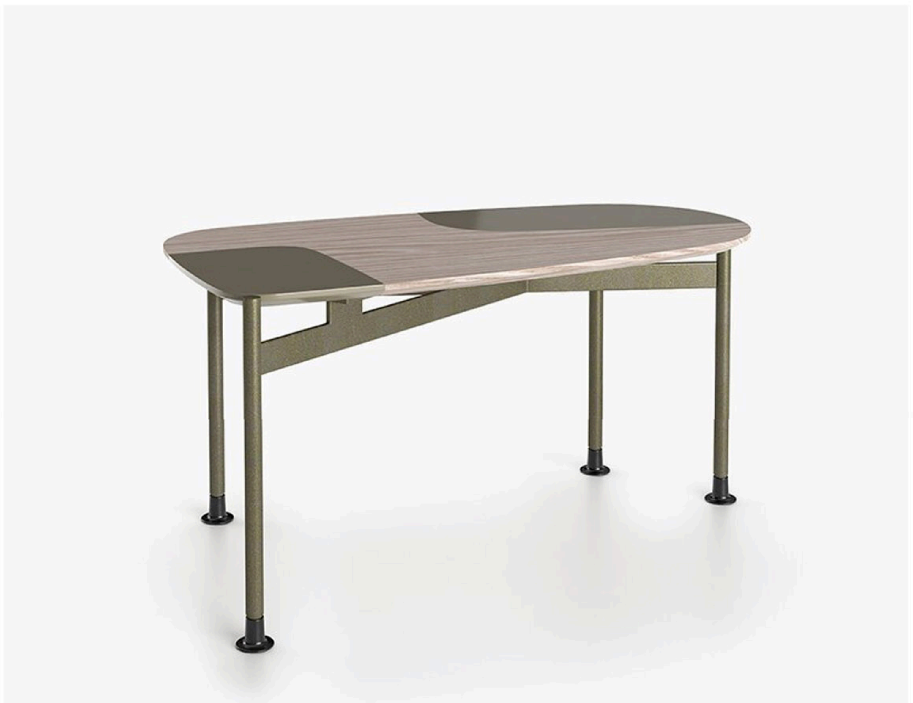
the ika system desk appears with the same structure as the coffee tables

the same structure defines the desk that emphatically features a large natural oak top with lacquered inserts. the accompanying practical and functional dresser adorns a similar lacquered finish as the desk. discrete cushioning lines the drawers whilst swivel wheels enable it to be moved wherever the user wishes. the versatile, modular and movable designs help make your house a home.