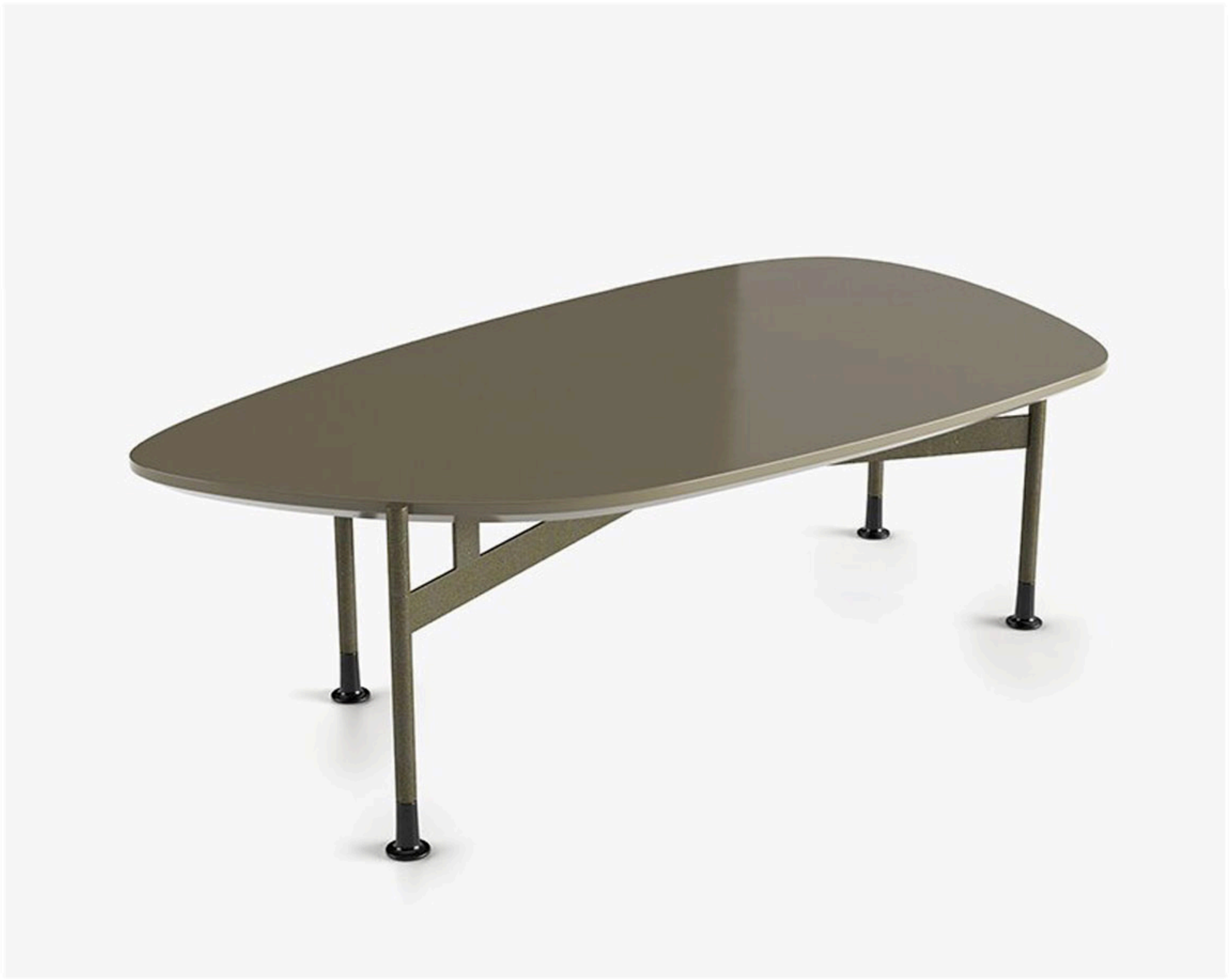
one of the many differently sized coffee tables of the ika system

the same structure defines the desk that emphatically features a large natural oak top with lacquered inserts. the accompanying practical and functional dresser adorns a similar lacquered finish as the desk. discrete cushioning lines the drawers whilst swivel wheels enable it to be moved wherever the user wishes. the versatile, modular and movable designs help make your house a home.